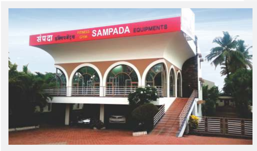
Factory & Head Office